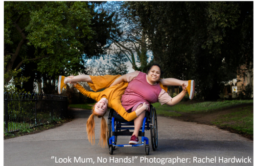
"Look Mum, No Hands!"