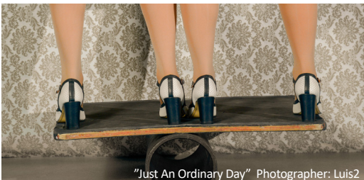
"Just An Ordinary Day"