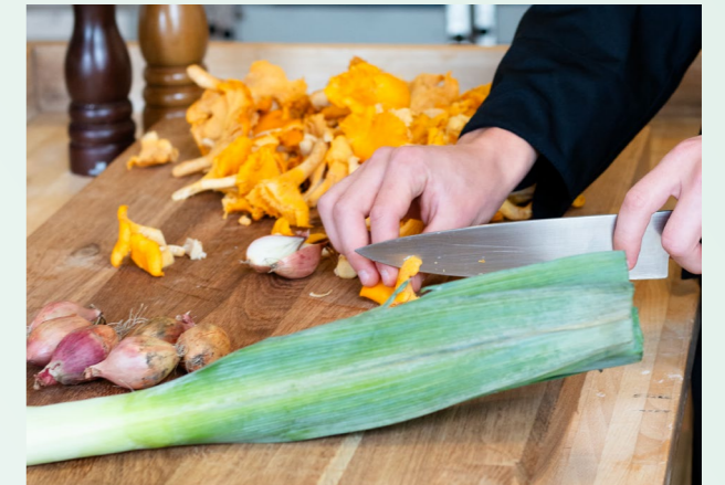
THE RESTAURANT MANAGEMENT AND FOOD PROGRAMME