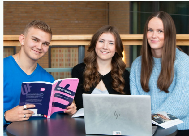
THE BUSINESS MANAGEMENT AND ECONOMICS PROGRAMME

Higher Education Preparatory Programmes in Swedish upper secondary schools are designed to prepare students for higher education at universities and colleges. These programmes focus on theoretical knowledge, critical thinking, and academic skills. Students can choose from different specializations, such as natural sciences, social sciences, economics, and the arts. Upon graduation, students receive a diploma that qualifies them to apply for higher education, provided they meet the specific entry requirements of their chosen field of study. At Marks Gymnasieskola we have 5 different Higher Education Preparatory Programmes.