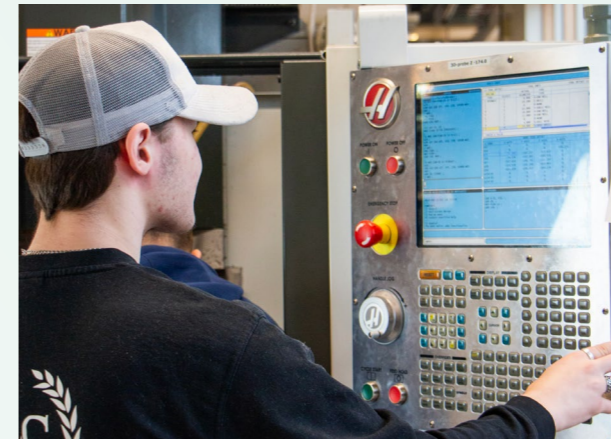
THE INDUSTRIAL TECHNOLOGY PROGRAMME