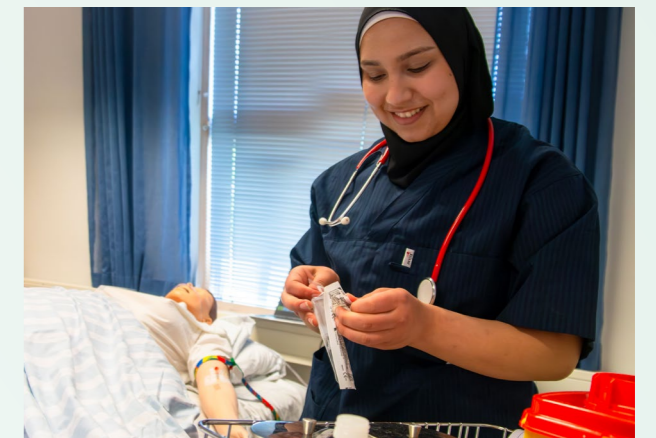
THE HEALTH AND SOCIAL CARE PROGRAMME