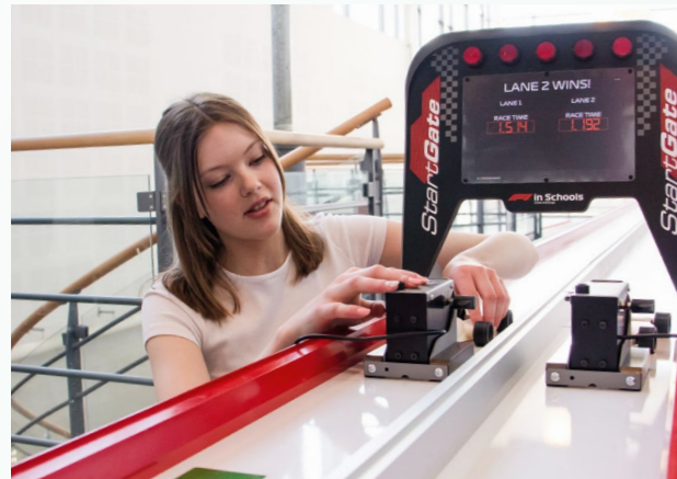
THE TECHNOLOGY PROGRAMME