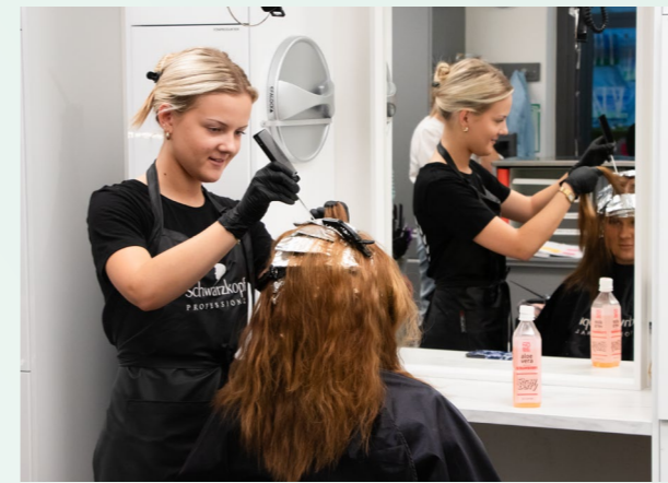
THE HAIRDRESSER AND STYLIST PROGRAMME