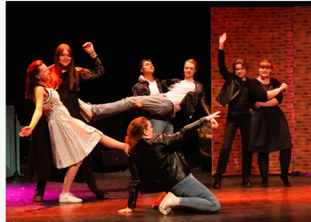
THE ARTS PROGRAMME