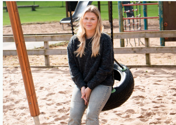
THE CHILD AND RECREATION PROGRAMME

Upon graduation, students are qualified to work in their chosen profession but can also pursue further studies if they meet certain requirements. At Marks Gymnasieskola we have 10 different vocational programmes.