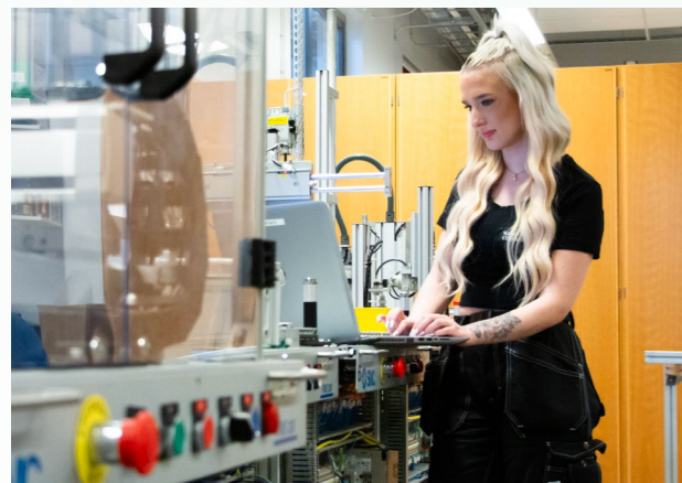
THE ELECTRICITY AND ENERGY PROGRAMME