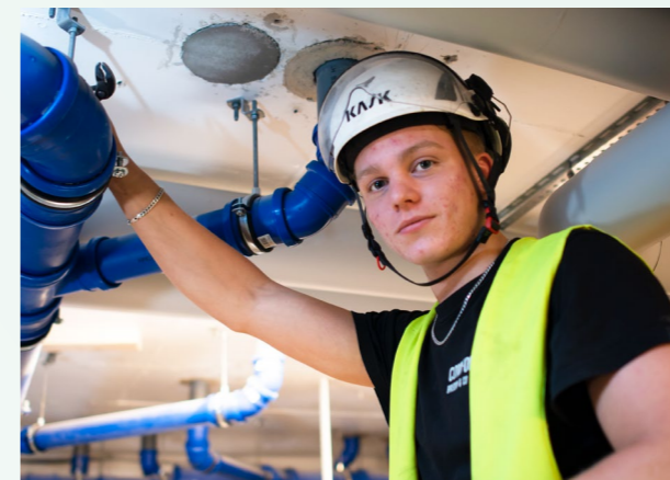
THE HVAC AND PROPERTY MAINTENANCE PROGRAMME