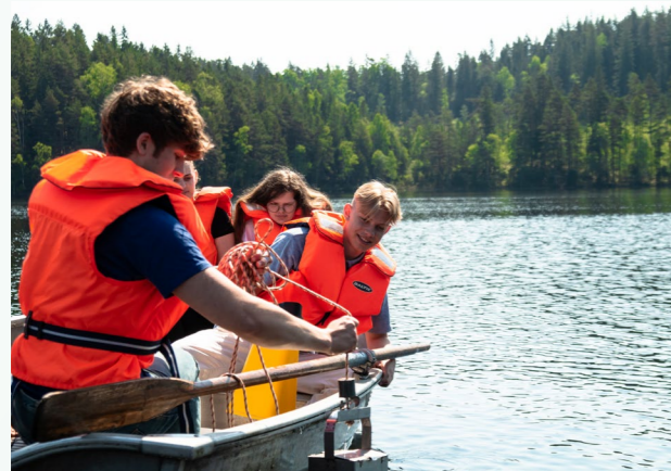
THE NATURAL SCIENCE PROGRAMME